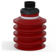
Variant reference: 92 50SL 38D-2