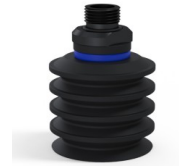
Variant reference: 92 50NI 38D-2