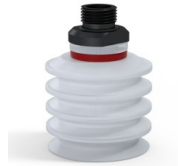
Variant reference: 92 50SLT 38D-2