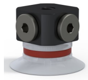
Variant reference: 90 20SLT FM5BD