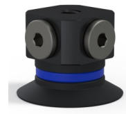
Variant reference: 90 20NI FM5BD