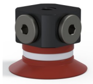
Variant reference: 90 20SL FM5BD