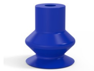
Variant reference: 1 16PU A