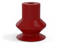
Variant reference: 1 16SL A