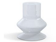
Variant reference: 1 16SLT A