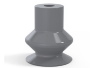
Variant reference: 1 16NR A