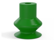
Variant reference: 1 16SLV A