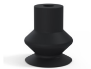
Variant reference: 1 16NI A