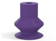
Variant reference: 1 16MNT A