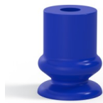
Variant reference: 1 12PU A