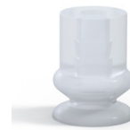
Variant reference: 1 12SLT A