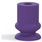
Variant reference: 1 12MNT A