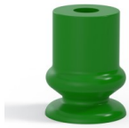
Variant reference: 1 12SLV A