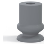
Variant reference: 1 12NR A