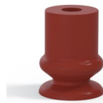
Variant reference: 1 12SL A