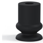
Variant reference: 1 12NI A