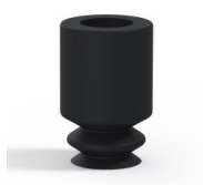
Variant reference: 1 05NI A