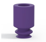
Variant reference: 1 05MNT A