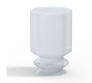
Variant reference: 1 05SLT A